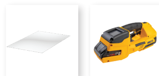
■ Screen protector for additional protection