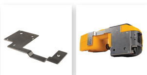
■ Protection plate for usage on abrasive surfaces